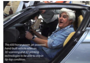
3D Printing & Scanning